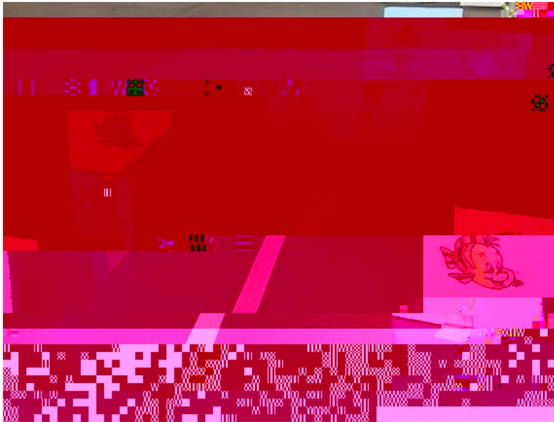
Figure 4 - Position of walls