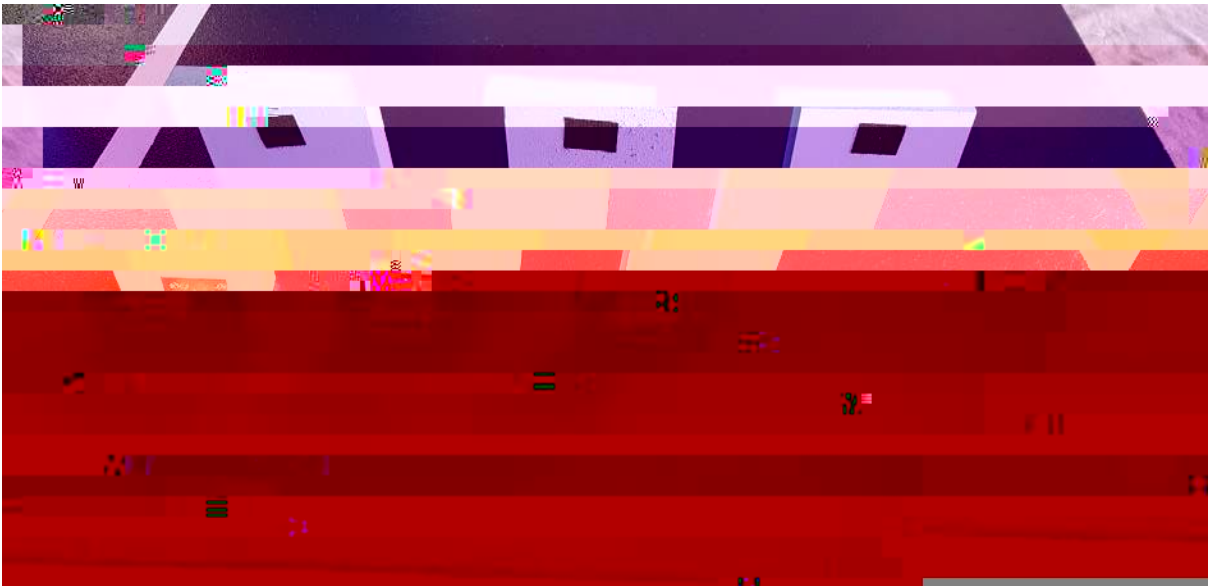
Figure 2 - Velcro attached to the back of the pirate ships