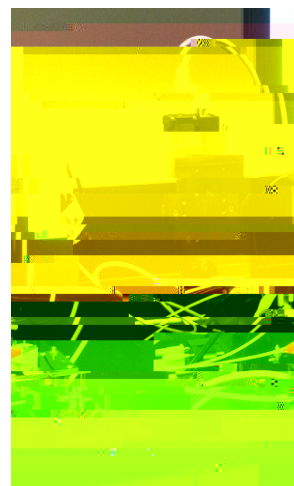
Figure: Scanning Electrochemical Microscope